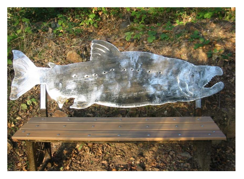
Salmon Bench – Country Club Trail