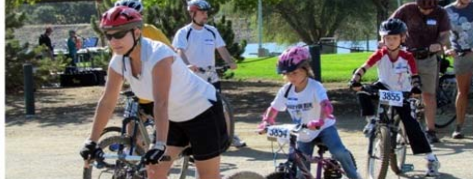
Riverview Park Pump Track and Kids Day Ride