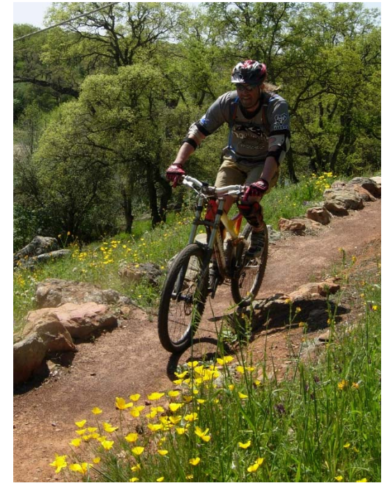
Spring on Split Rock Trail